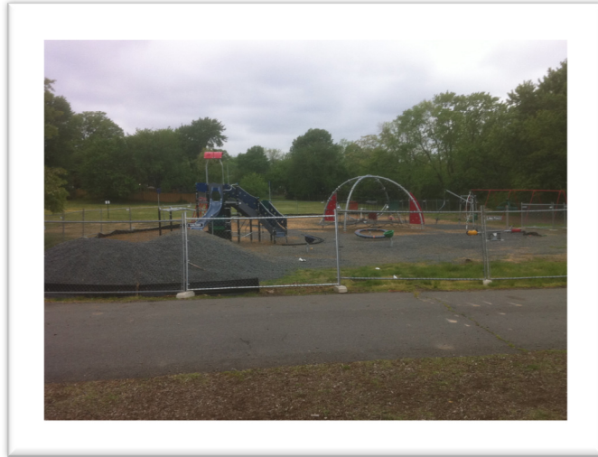
| Cora Kelly: existing playground

Site drainage issue along the preK wall will be addressed in the month of July. Flooring replacement project and structural damage repairs will be addressed throughout the summer months. Roof replacement is currently scheduled to begin in late July/early August and will be coordinated with the Basement emergency work repairs.