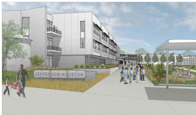
| Jefferson-Houston: concept design

Design work is continuing for the new school project. A meeting with the Parker-Gray Board of Architectural Review is scheduled for July 18 th . Construction Management (CM) contract will be approved in early July. The CM will provide valuable cost estimating and design guidance to ensure ACPS has the information needed to make decisions about critical building components such as mechanical systems, sustainability alternatives, interior and exterior finishes, and site landscaping.