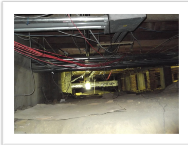
Matthew Maury: crawl space on the outside wall of the basement

Basement emergency repairs are scheduled to begin in July. This work will be coordinated with other building envelope related repairs that include but are not limited to roof replacement.