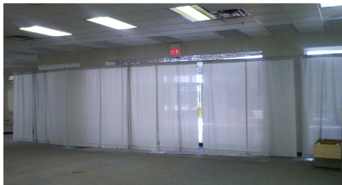
Landmark Mall: T.C. Williams satellite classroom space.

Educational Facilities will be transforming two retail spaces to accommodate the T.C. Williams Satellite campus. The exact scope of work is yet to be determined and meetings with appropriate ACPS staff to define the program needs and requirements are underway. It is anticipated that the project will be completed by August 31 st .